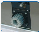
Mechanical limit switch